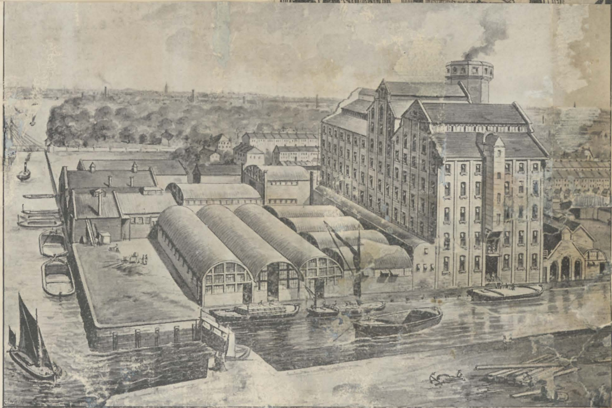
MESSRS. MARRIAGE, NEAVE & CO. LD., ALBERT BRIDGE MILL, BATTERSEA.